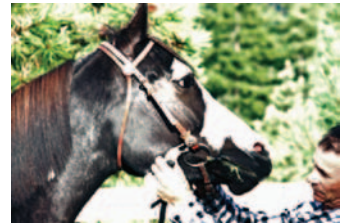
Head shot of horse salivating after jaw flexions in elevated position