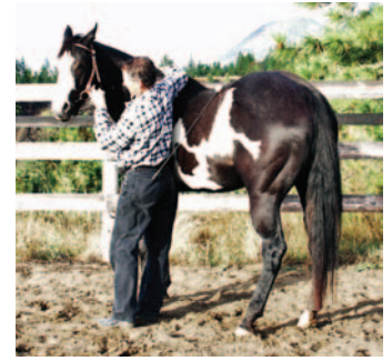
Standing to side of horse obtaining bend and then upward elevation with a jaw flexion using a single rein, but can also be done with supporting rein if horse tries to twist the poll