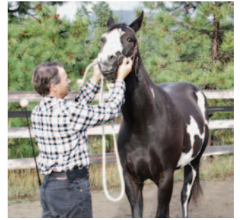
Standing jaw flexion, pressure upward in line with headstall side straps

Upon the release of pressure, the horse would salivate and lick