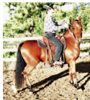
Stationary start to Roll-over with bend, jaw flexion, and start of application of heel pressure to start quartering with the hind