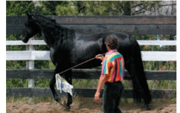
Pressure to nose to slow