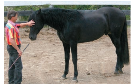
Touching with appreciation, security, calmness

backing up. When the horse becomes more comfortable, realizing I am looking to interact, I will slowly move backward and slightly sideways from the horse to try and draw it towards me. I will wave my whip or flag behind me, away from the horse, if it looks to avoid facing me. Every time I move my flag behind me to get the horse's attention and they seek me, I will stop. Every time the horse tries to look at me or moves towards me, I will cease the pressure to reward their attempt to connect. I would repeat this until the horse starts to realize that when I bring energy back into myself I am offering some of my space for them to share with me.