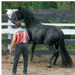
Pressure to turn nose to rail