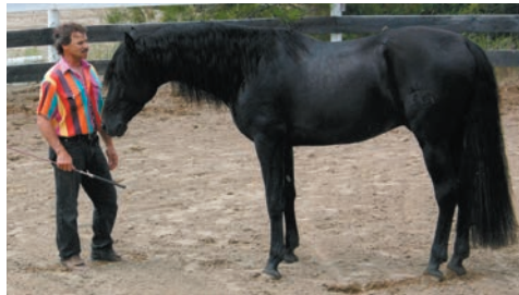
Quiet time after the draw until he offered connection to be touched