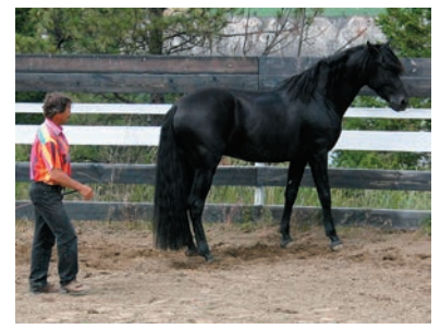
Pressure still pushing hip away and entice with right hand to track in

In the previous article, the photos showed putting pressure on zone 3 in front of the horse's head/nose, then moving closer to their face once they have slowed and recognized that they should yield to effect a turn away from you. If your request to yield is ignored, the key is to use your whip or flag more energetically ahead of zone 3 (sometimes way ahead) until the horse slows to look at your whip/flag. As they slow, you can then wave towards the nose and as the horse starts to turn away from you (into the rail) you should wave towards what was the inside shoulder so the horse completes the turn away from you. Keep slight pressure on the head and shoulder until the horse has passed 90 degrees to the rail. Wait for the horse to start moving ahead of you so that you remain in a good driving position at zone 1. Stay ready to slowly move to zone three with your eyes if the horse tries to turn back towards you.