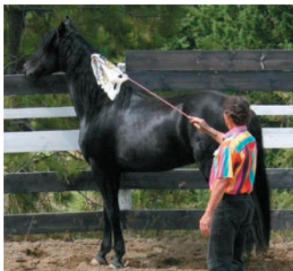
Pressure to stop