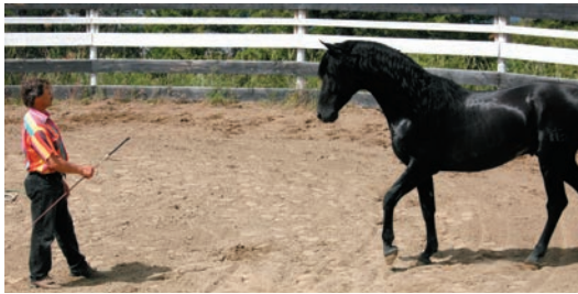
As he turned, I kept his energy coming forward towards me, changing the whip hand and vibrating behind me