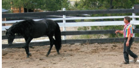
Rib pressure and softening on circle