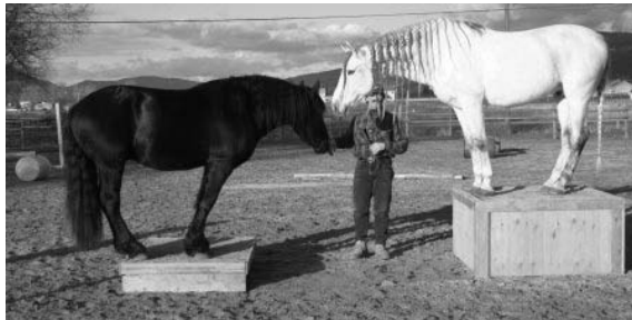
Quimerico reducing base of support Ljibbe relaxing at liberty