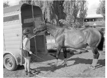
Acacia loading Misty