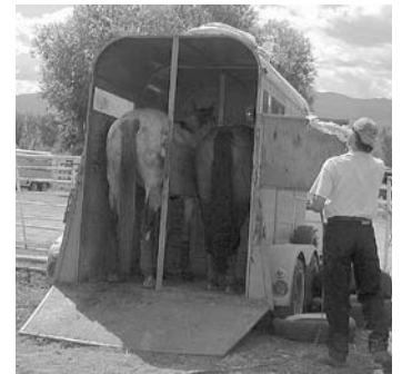
Loading with a bag of cans on top